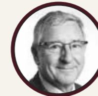
Vice-Chair Jim Fitzpatrick MP