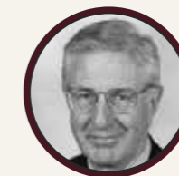
Vice-Chair Lord Richard Layard