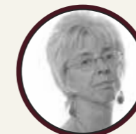
Vice-Chair Baroness Ruth Lister