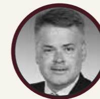
Co-Chair Tim Loughton MP