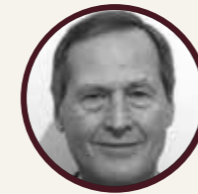
Secretary Lord Alan Howarth